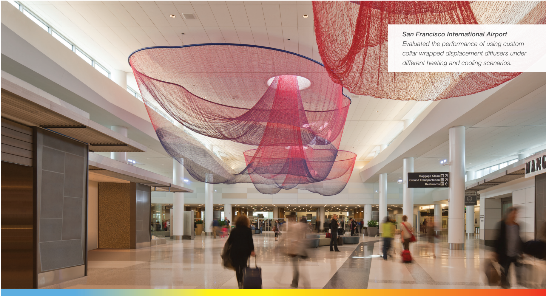
San Francisco International Airport Evaluated the performance of using custom collar wrapped displacement diffusers under different heating and cooling scenarios.

Ventilation System: Hybrid displacement and mixing